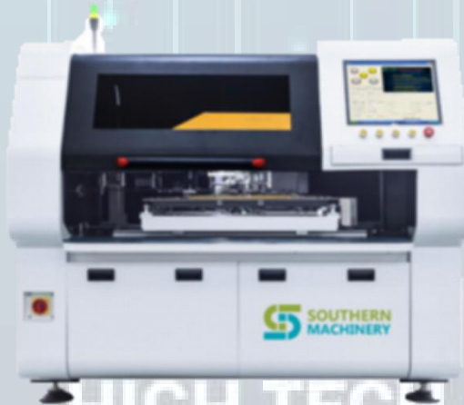
Axial Component Solutions