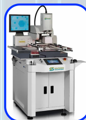
BGA Rework Station

This equipment is used for automatic soldering PCB(4 axis)