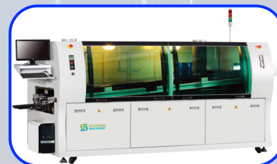
Wave Soldering Machine

The equipment can be used for PCB repair (PCB size is 630*610mm)