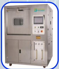
PCBA Cleaning Machine