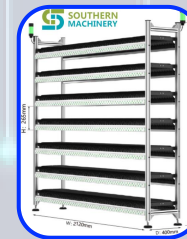
Intelligent reel rack

This device is necessary for channel production line