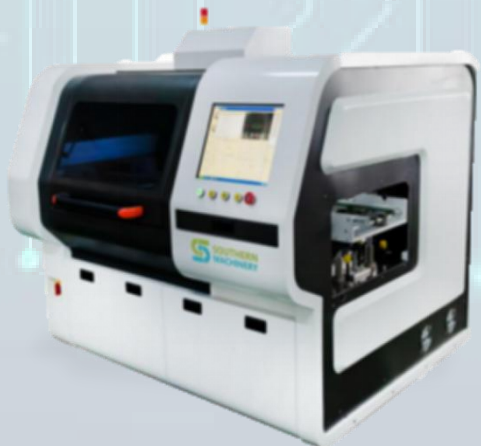
Radial Component Solutions