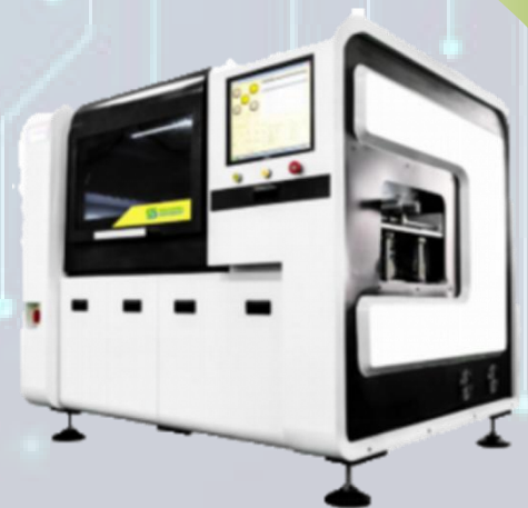
Odd Component Solutions