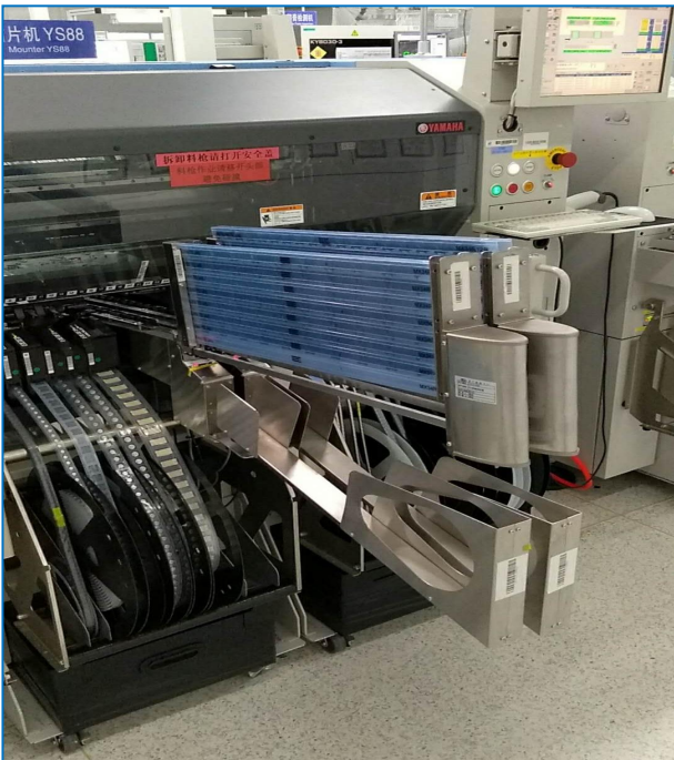
YAMAHA odd form machine install tube feeder