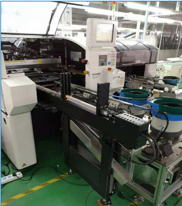
Panasonic CM602 odd form machine install tube feeder+bowl feeder