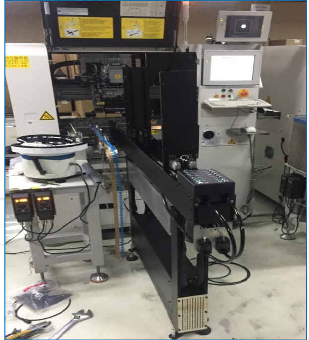
JUKI odd form machine install tube feeder+bowl feeder+radial tape feeder