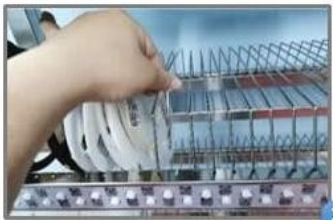
Take out the partition net to be adjusted