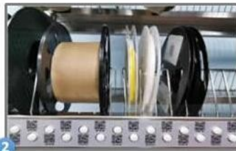
Adjust width dynamically according to material thickness