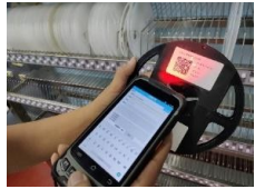
Scan material barcode