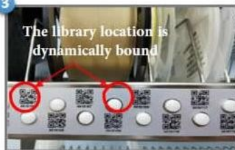
LED Indicator automatically combined display