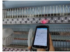
Scan code for any empty location