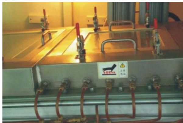
Nitrogen gas control system