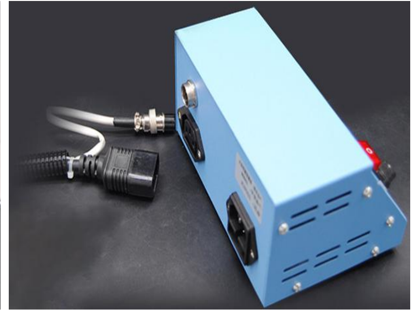
Separate power socket

if the power cord is damaged or the machine fails, it is convenient for maintenance, and if the work requires a longer cord, it is convenient for replacement