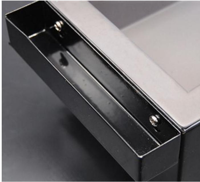
Tin slag collector