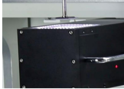
CCD optical align lens