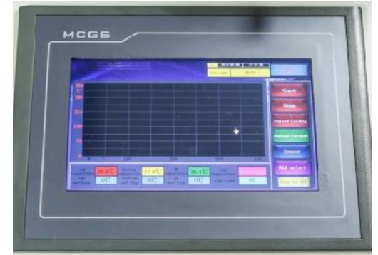
Touch screen control